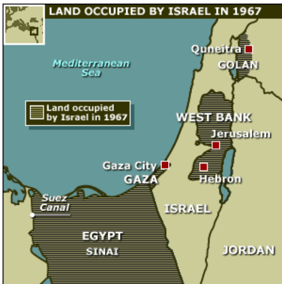
Land gained by Israel following the 1967 War. Map courtesy of BBC News, 2001.

The war was a military disaster for the Arabs and a massive blow to morale. Israel’s land capture created a new wave of displaced persons. From 1967 until the establishment of the Palestinian Authority in 1994, the Israeli government revoked the residency rights of those Arabs (some 250,000) who had left the West Bank or Gaza for more than seven years. By 1972, there were 1.5 million registered Palestinian refugees, 650,000 of whom live in 13 camps in Palestine, Jordan, Syria and Lebanon. Israeli forces quelled resistance to the occupation with brutal force: in just a few days after the war the Israeli army destroyed 850 buildings in the town of Qalqilya.