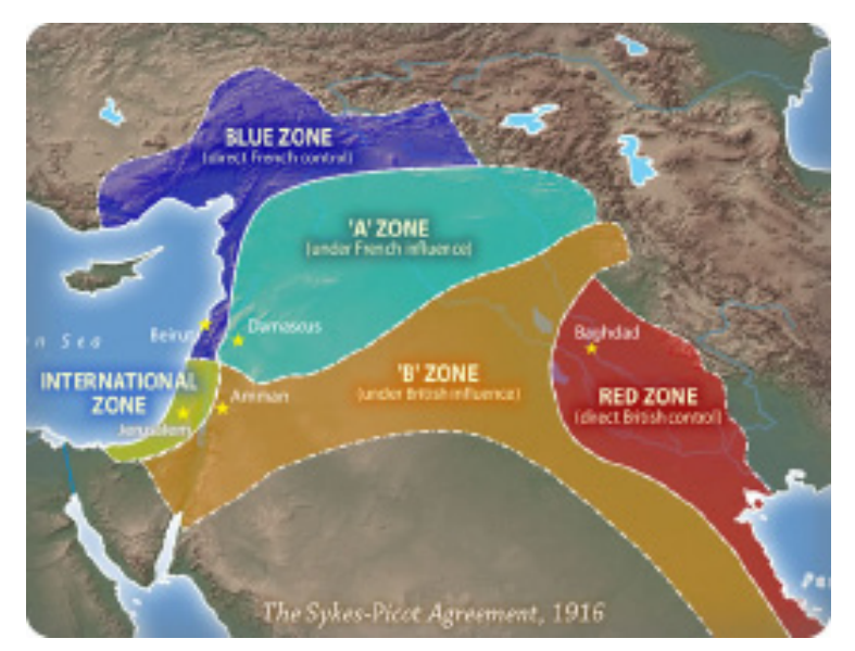
Zones of influence established in the agreement.

At the turn of the century, the Ottoman Empire comprised several provinces administered by governors who reported to the Sultan in Constantinople. The Sykes-Picot Agreement proposed spheres of control in the Levant should the Triple Entente succeed in dismantling the Empire.<sup>1</sup> It was envisaged that France would acquire most of Ottoman Syria (Syria and Lebanon) while Britain would take control of Ottoman Mesopotamia and the southern part of Ottoman Syria (Iraq and Transjordan). Palestine was to be internationally administered, but in reality the British became the de facto ruler from 1917-1948. The Allies endorsed Russia's post-war occupation of certain northern parts of the Ottoman Empire (Armenian provinces and some Kurdish territory) for Russian acceptance of the Agreement. Planning continued at the San Remo conference where the League of Nations mandates were determined. The agreement gained legal status with the ratification of the British Mandate for Palestine and Transjordan,