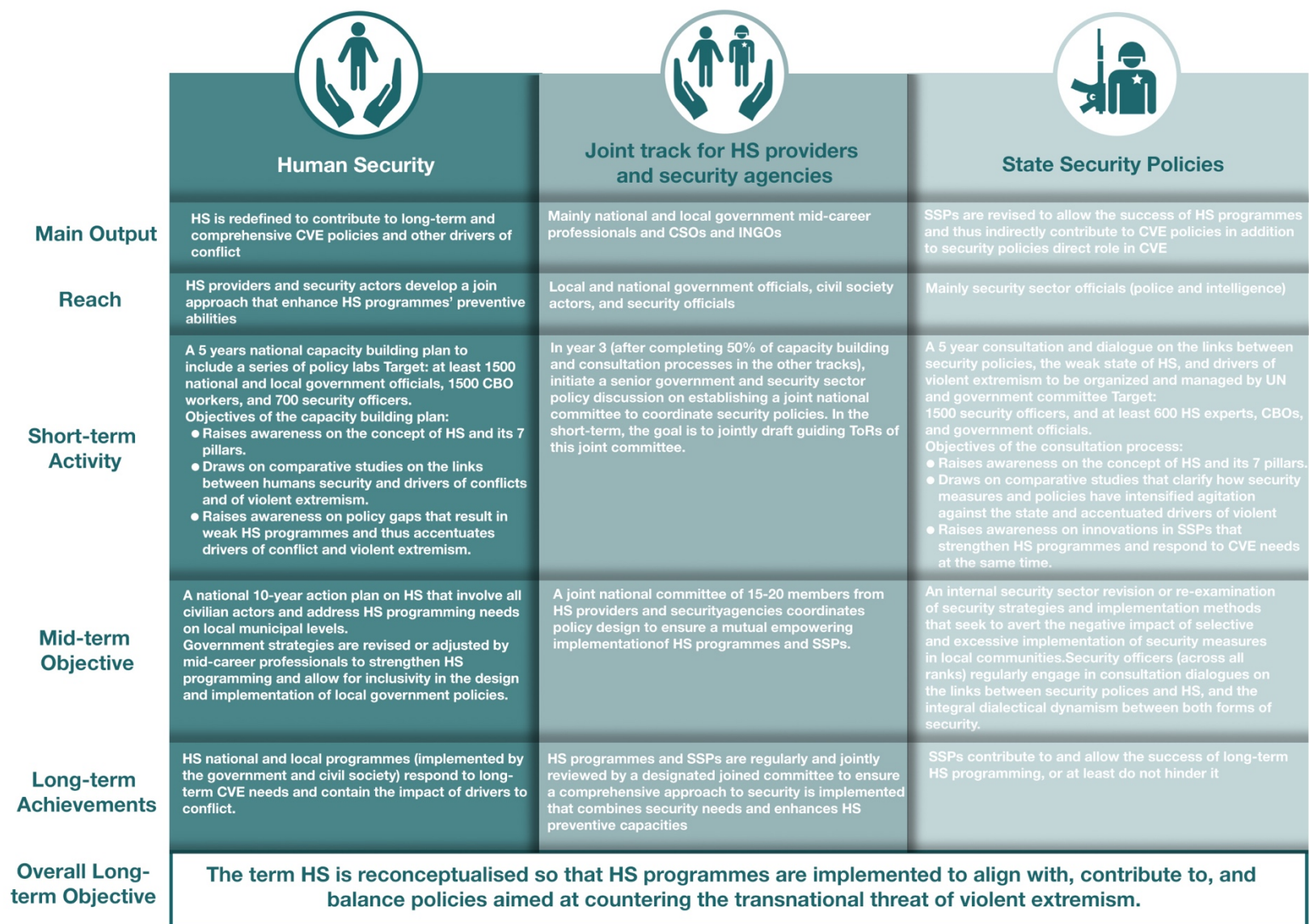
Figure 3: Theory of Change